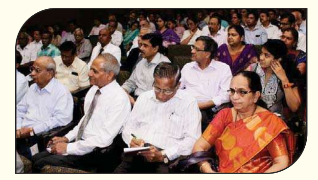
Another Section of audience engrossed in the lecture